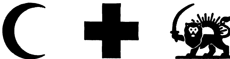
Figure 2: Distinctive emblems in red on a white ground

2. At night or when visibility is reduced, the distinctive emblem may be lighted or illuminated; it may also be made of materials rendering it recognizable by technical means of detection.